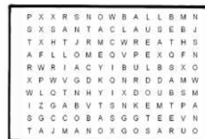
Christmas Snowman Word Search

Need a space for up to 49 people for a class, meeting or group activity? The TTCC is ADA accessible, has a kitchenette, air conditioning, tables and comfortable chairs. These kinds of events are welcomed and individualized arrangements can be made, call 298-9813.